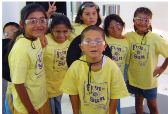
FITS participants touring BEGA in Carpinteria

By utilizing the strengths of over 60 local partners, the program offers a comprehensive package that no single organization can provide on its own. In fact, because of its success in reversing summer learning loss, last year FITS was awarded the 2012 Excellence in Summer Learning Award from The National Summer Learning Association (NSLA), an affiliate of Johns Hopkins University. Since 1997, 90 community partners have contributed to the program's success and the program has served more than 2,500 local children and 1,500 parents.