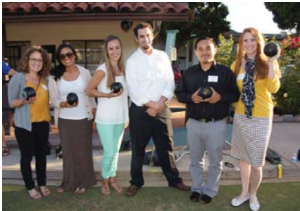
YLS Members and guests at SB Lawn Bowls Club