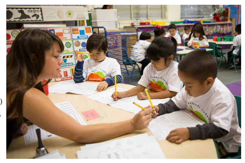
An instructor with Kindergarten Success Institutes participants at Harding Elementary School

Through KSI, UWSBC provides curriculum and credentialed teachers to help more than 150 students master the social/emotional, language, motor and approach to learning skills that are essential to their future success in kindergarten and beyond. This summer, dozens of incoming kindergarteners will learn the academic and social/emotional skills they need to be successful in kindergarten from day one.