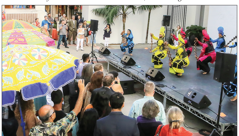
Guests are enthralled by power-packed Punjabi-style finale by UCSB Indian Dance group

Santa Barbara Museum of Art held its first Atelier event of the year, attracting 400 revelers to the tony State Street institution, where flowers reigned supreme, courtesy of our Eden by the Beach's garden club.