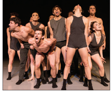
State Street Ballet's Women's Work performance at the New Vic

State Street Ballet took over the Ensemble Theatre's New Vic for its entertaining production Women's